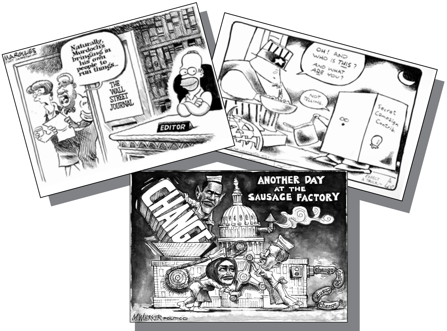
A sampling of cartoons previously auctioned at Cartoons & Cocktails

For two decades, each year's Pulitzer Prize winner for editorial cartooning has served as honorary chairman of Cartoons & Cocktails .